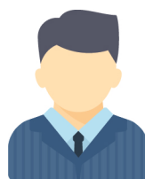
C Suite 9%